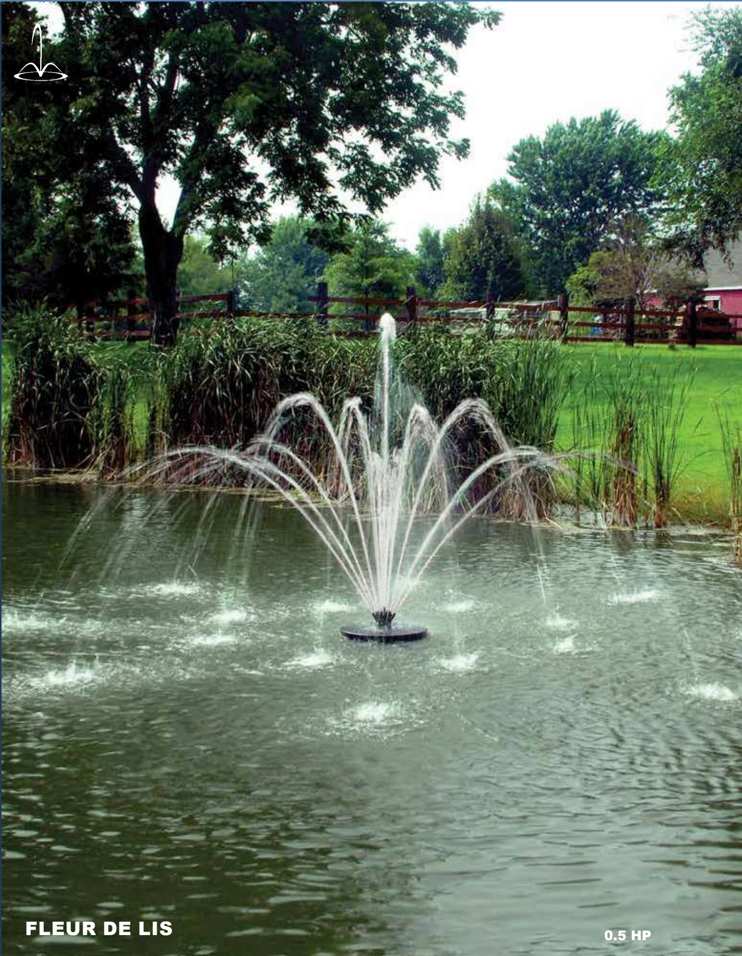
FLEUR DE LIS