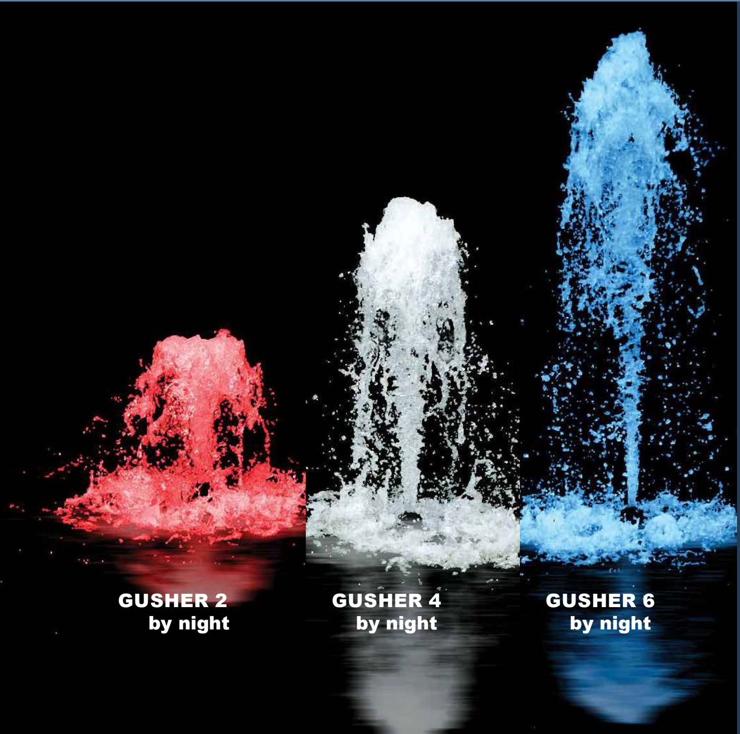
GUSHER 2 by night