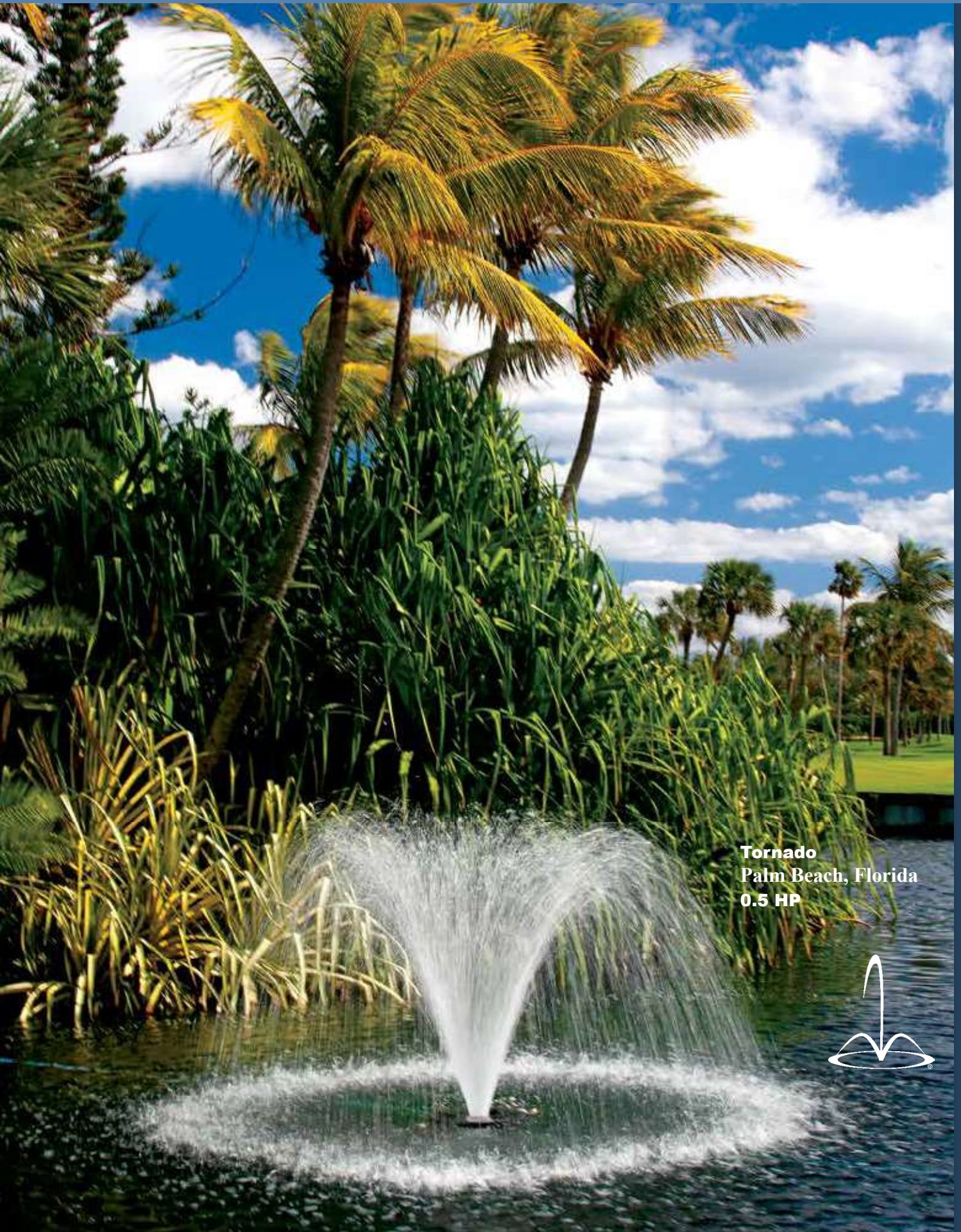
Tornado Palm Beach, Florida 0.5 HP