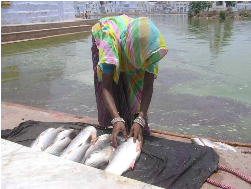
Pushkar Sarovar - Fish Kill of September 2008

Historically, Pushkar Lake would stink once in a while when the water was especially stagnant and warm, while the clarity of water and the water quality itself has been poor for decades. As Pushkar Lake is a holy one, Hindu pilgrims would bathe with phosphorus soap and drink the dubious water, which would cause them to become infected with various diseases and then fall very ill. Furthermore, as a holy Hindu lake with the only Brahma temple in the world, pilgrims would give offerings in the Hindu tradition by pouring milk and grain into the lake. This milk and grain, which is essentially organic matter, along with rain after a dry spell (the first flush), would bring in pollution from all the surrounding urban development which would cause periodic fish kills. The dire state of the lake along with the increasing numbers of pilgrims falling ill from the dubious water had become quite the embarrassment for the local government and the town itself. The situation became dire when in September of 2008 a massive fish kill occurred. The government asked us to immediately save the lake, as detailed in the next section.