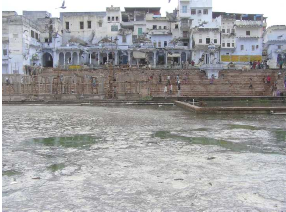
Pushkar Sarovar - Fish Kill of September 2008