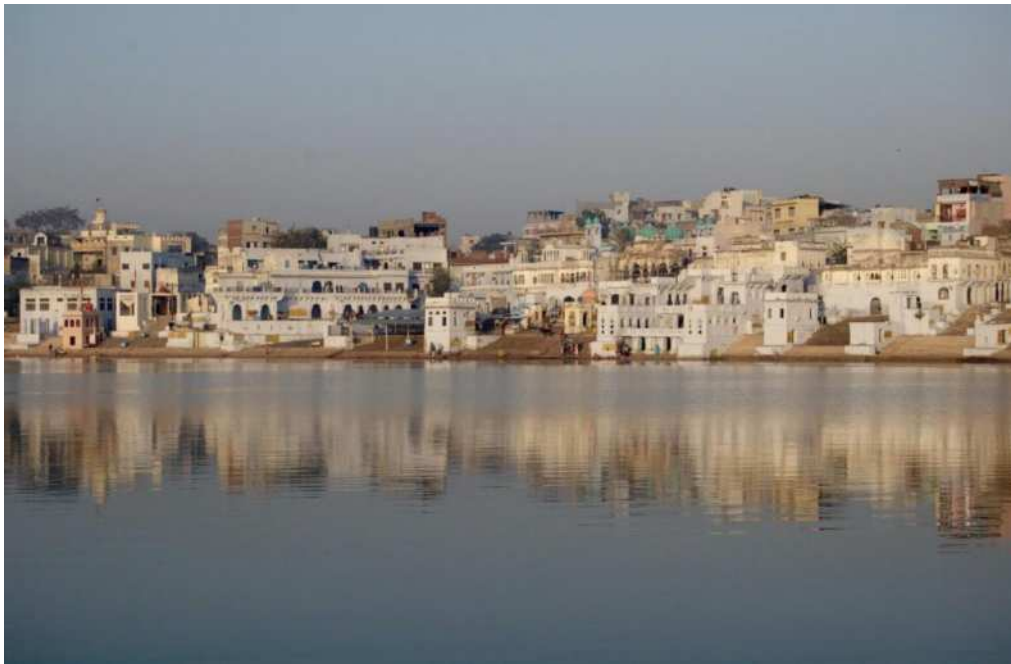
Pushkar Sarovar - January 2009 - 69 Days into Aeration

India South Zone: #536, Jal Vayu Towers, NGEF Layout, Indiranagar P.O., Bangalore 560 038.