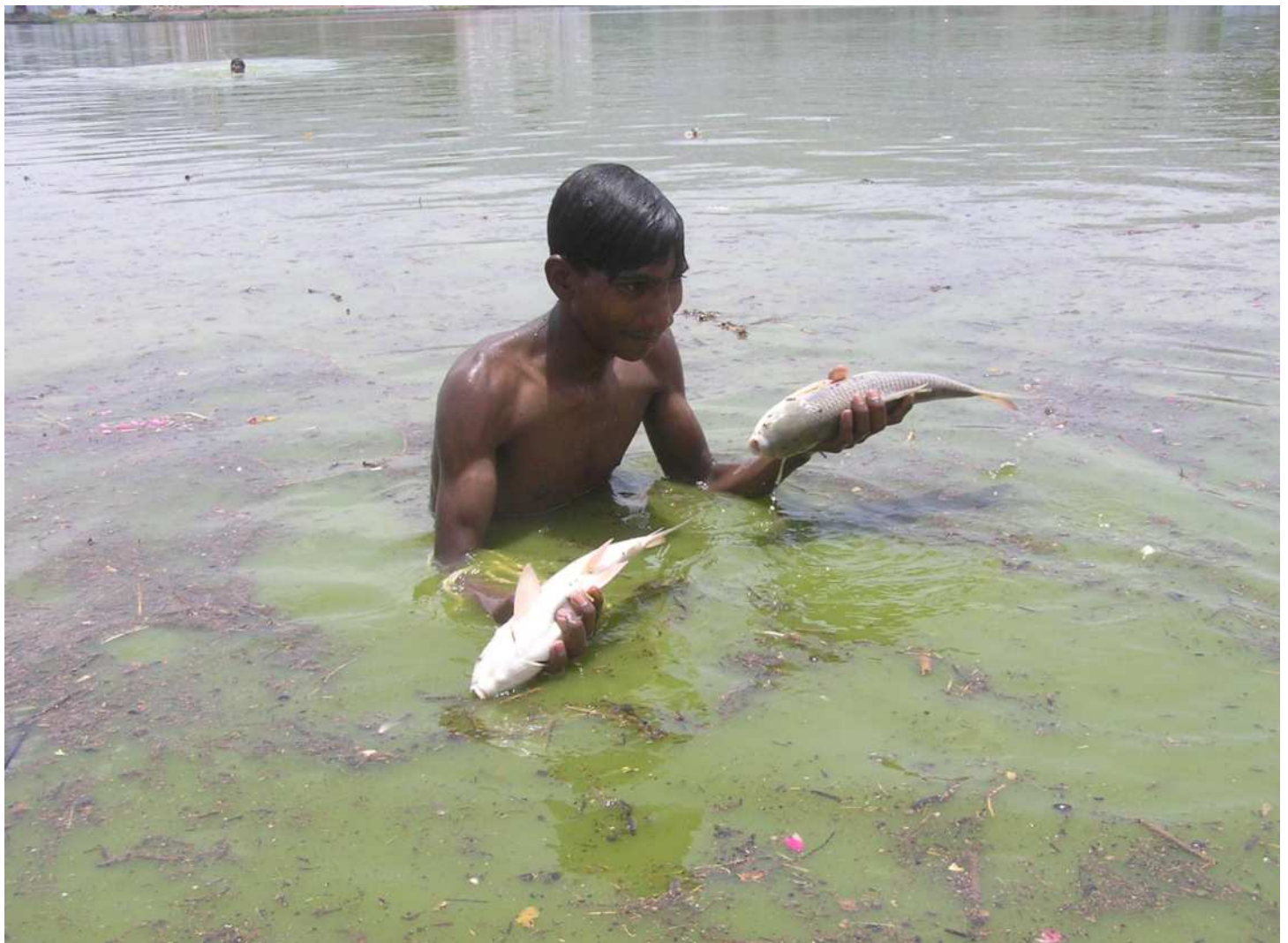
Pushkar Sarovar - Fish Kill of September 2008

India South Zone: #536, Jal Vayu Towers, NGEF Layout, Indiranagar P.O., Bangalore 560 038.