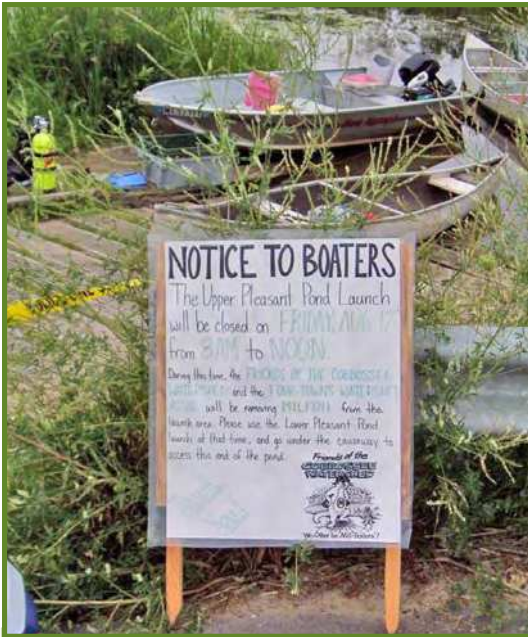
In the effort to reduce boat/plant contact, much focus has been placed upon controlling the infestation at the public boat ramps. Here signage informs boaters that the launch site is temporarily closed, allowing the control work to proceed safely without interruption.