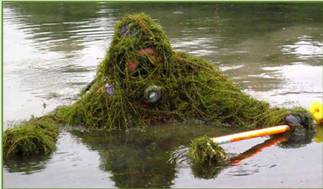
A diver emerging from a hydrilla-infested pond.