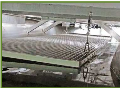
CLA's DASH has been outfitted with a winchable platform, made of aluminum mesh and aluminum angle bracing, a lightweight platform that can be moved up and down with cables and an electric winch that is operable from the deck of the boat.

The outcome of CLA's plant removal in Shagg Pond has been mixed. Although a great deal of variable watermilfoil has been removed, new patches have started appearing. While the crew was concentrating on the largest patches of dense growth, individual plants and small patches were exploding under the radar. "Think about it this way," says Jim. "A single plant takes about two years to become ten feet tall. When a plant grows to this size it becomes flaccid. At the end of the season the tall stems lie down and new roots shoot out into the sediment all along each stem. The following season, where there had formerly been a single plant, there is now a thick patch 20 feet in diameter." The infestation on Shagg Pond has grown from just over ½ acre to about 3 acres despite intense control activity.