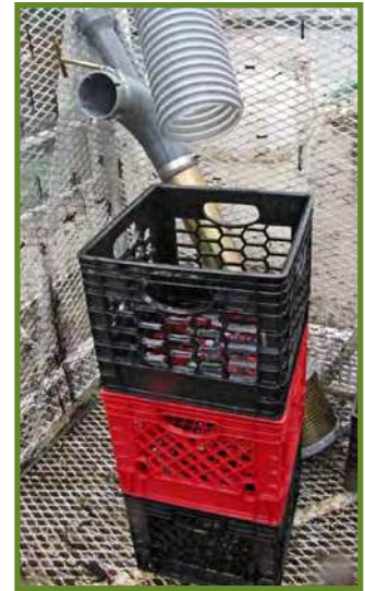
As CLA does not have access to a dock, nor a large machine or winch system to remove the baskets, their design uses milk crates to catch the harvested variable watermilfoil.